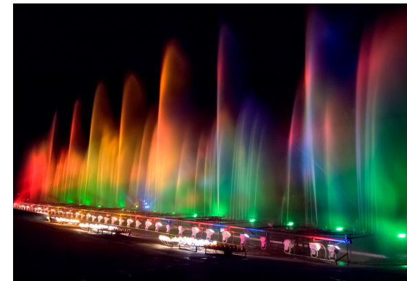
Pictured above is Grand Haven's Musical Fountain. Since 1962 the fountain has become a central feature of the Grand Haven waterfront area.

Crockery Township is pleased to present this year's Drinking Water Quality Report. This report is designed to inform you about the quality of the water we deliver to you everyday. Our constant goal is to provide you with a safe and dependable supply of drinking water. We are committed to ensuring the quality of your drinking water.